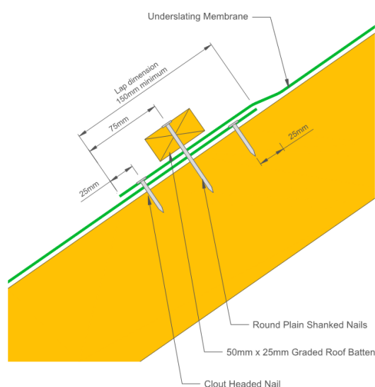
Figure 2: Creating the Overlap - Battened Overlap Detail

When being used unsupported, the roofing membrane should achieve a nominal 10mm drape in between the support positions in order to prevent contact with the underside of the tiles, thus avoiding the transfer of wind loading to the primary roof covering. The drape also serves as drainage for water within the batten space to the eaves position and into the gutter. Fully supported membranes i.e. installed over sarking boards must incorporate counter battens.