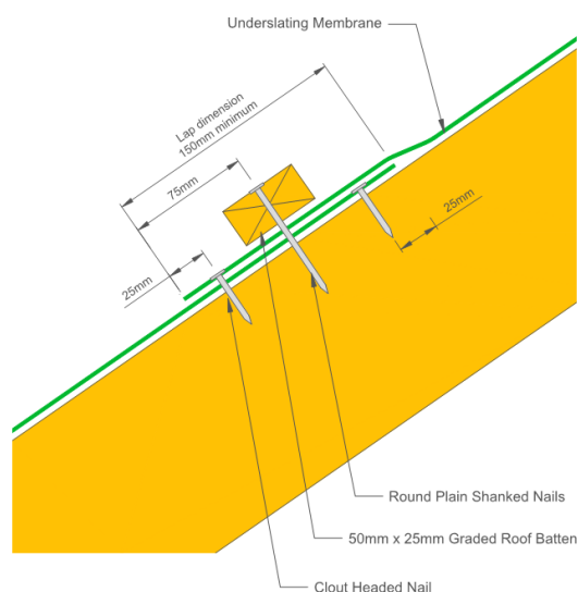
Figure 2: Creating the Overlap - Battened Overlap Detail

When being used unsupported, the roofing membrane should achieve a nominal 10mm drape in between the support positions in order to prevent contact with the underside of the tiles, thus avoiding the transfer of wind loading to the primary roof covering. The drape also serves as drainage for water within the batten space to the eaves position and into the gutter. Fully supported membranes i.e. installed over sarking boards must incorporate counter battens.