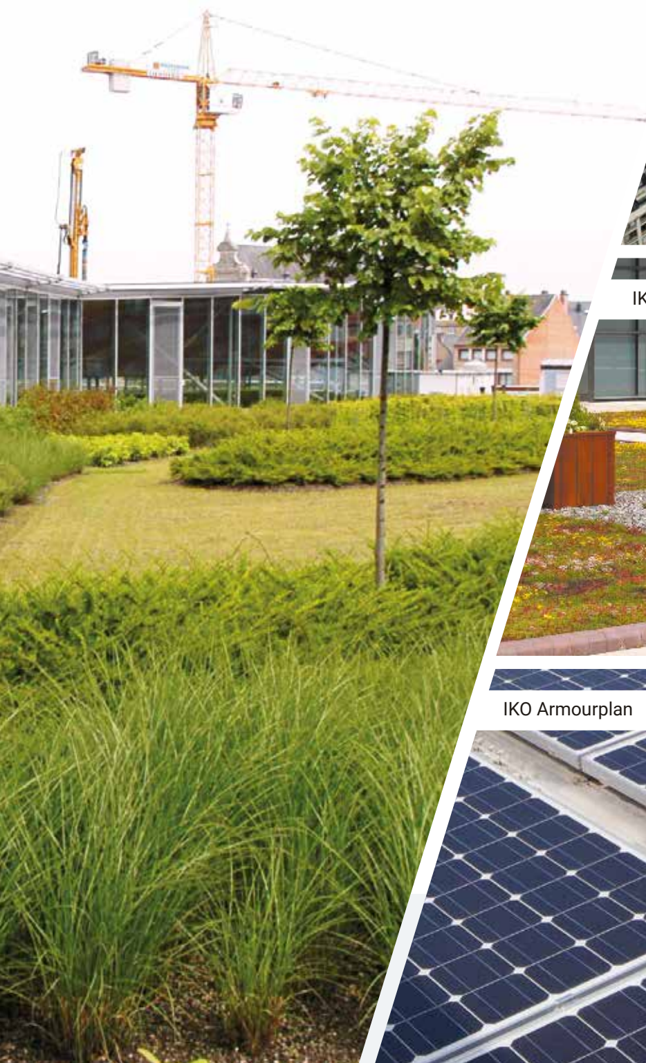
IKO Anti-Root Bituminous Membrane