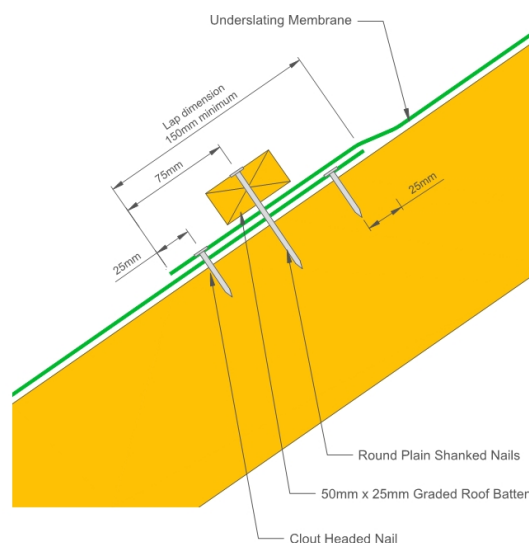
Figure 2: Creating the Overlap - Battened Overlap Detail

When being used unsupported, the roofing membrane should achieve a nominal 10mm drape in between the support positions in order to prevent contact with the underside of the tiles, thus avoiding the transfer of wind loading to the primary roof covering. The drape also serves as drainage for water within the batten space to the eaves position and into the gutter. Fully supported membranes i.e. installed over sarking boards must incorporate counter battens.