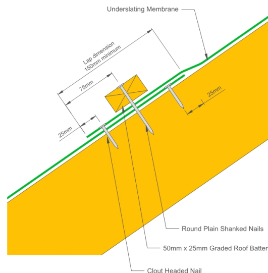
Figure 2: Creating the Overlap - Battened Overlap Detail

When being used unsupported, the roofing membrane should achieve a nominal 10mm drape in between the support positions in order to prevent contact with the underside of the tiles, thus avoiding the transfer of wind loading to the primary roof covering. The drape also serves as drainage for water within the batten space to the eaves position and into the gutter. Fully supported membranes i.e. installed over sarking boards must incorporate counter battens.